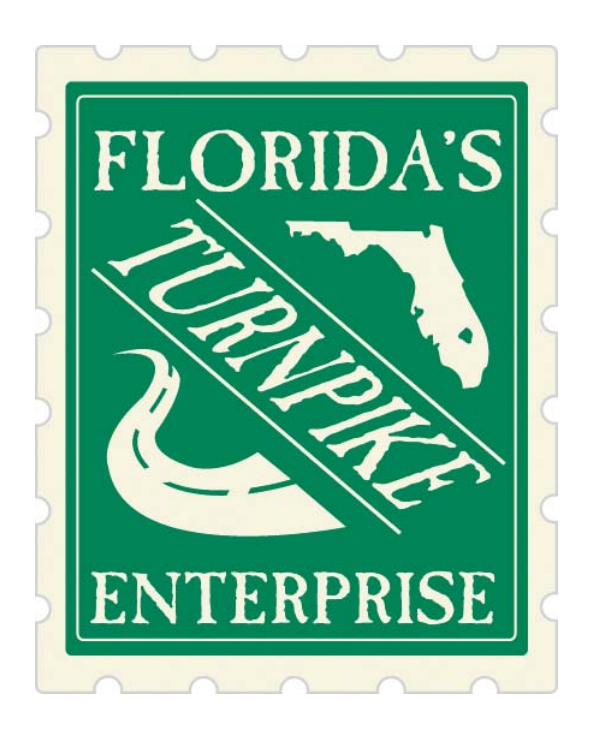
EXHIBIT "C" BID BLANK