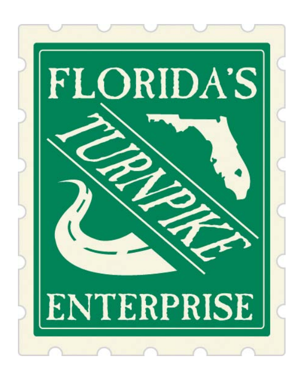
EXHIBIT "B" METHOD OF COMPENSATION