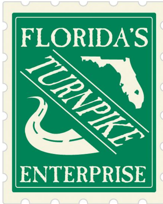
EXHIBIT "B" METHOD OF COMPENSATION