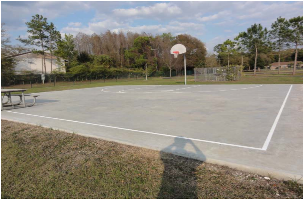
Original Carrollwood Park - September 2010