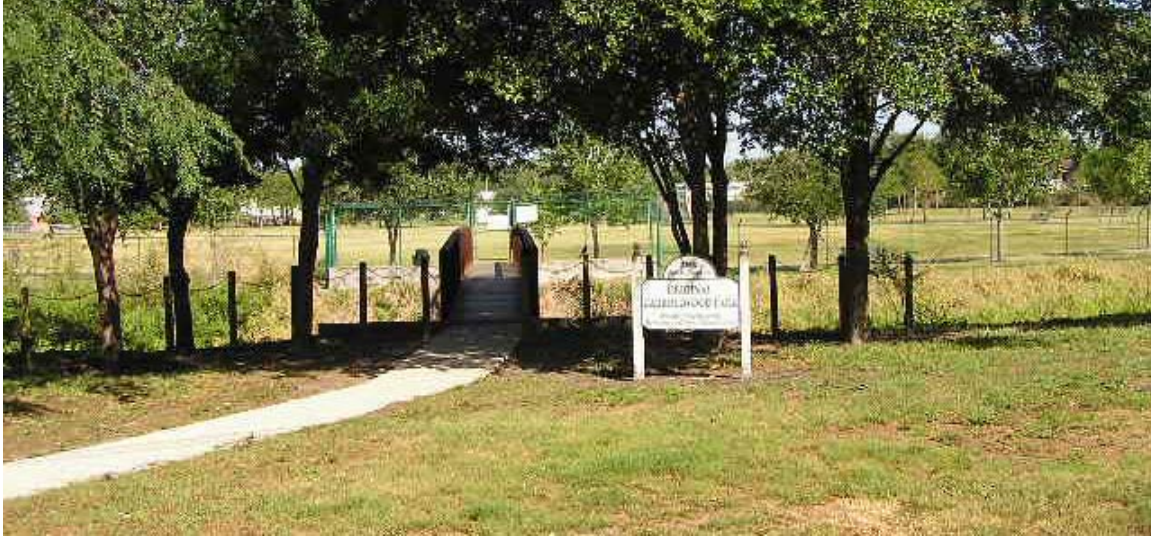
Original Carrollwood Park - May 2007