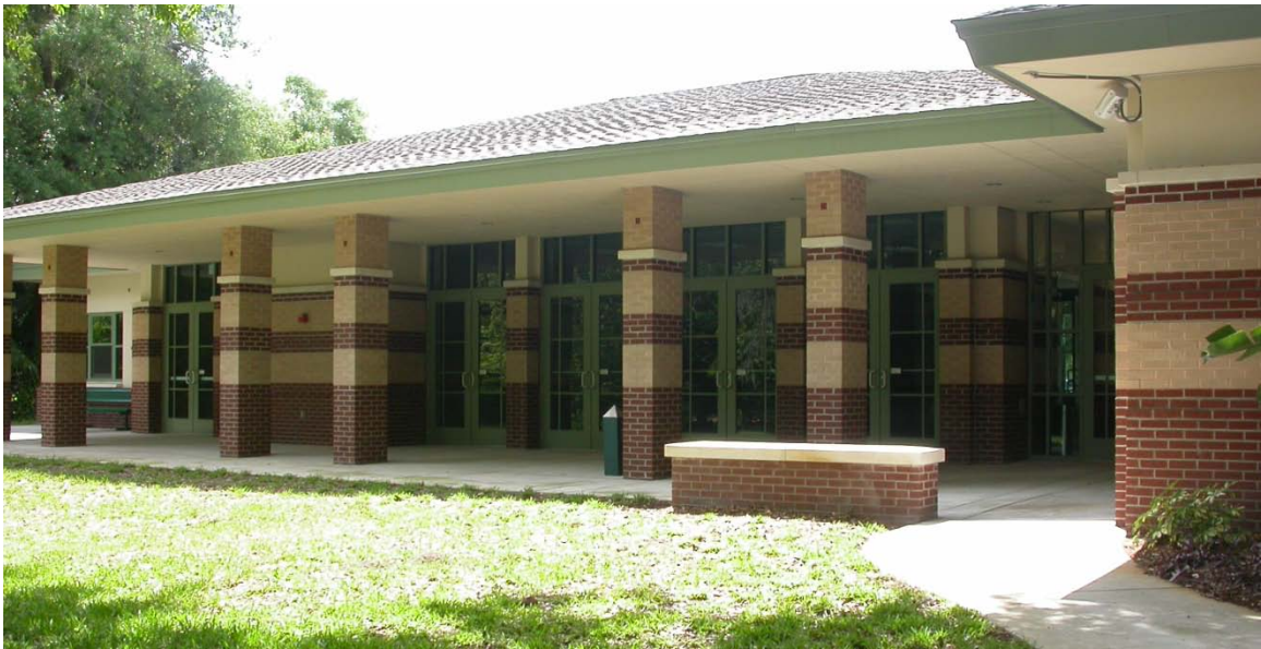
Recreation Center south elevation fm the tennis courts