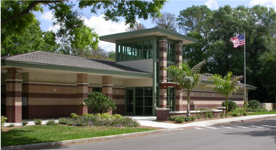
New Recreation Center (South Elevation)—officially opened June 16, 2007