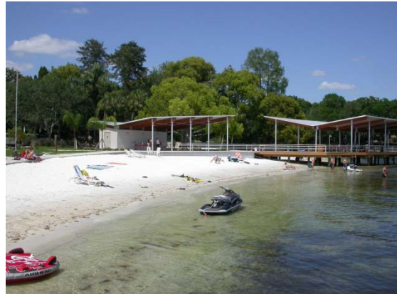
New pavilion, docks, and landscaping—May 2007 & April 2008