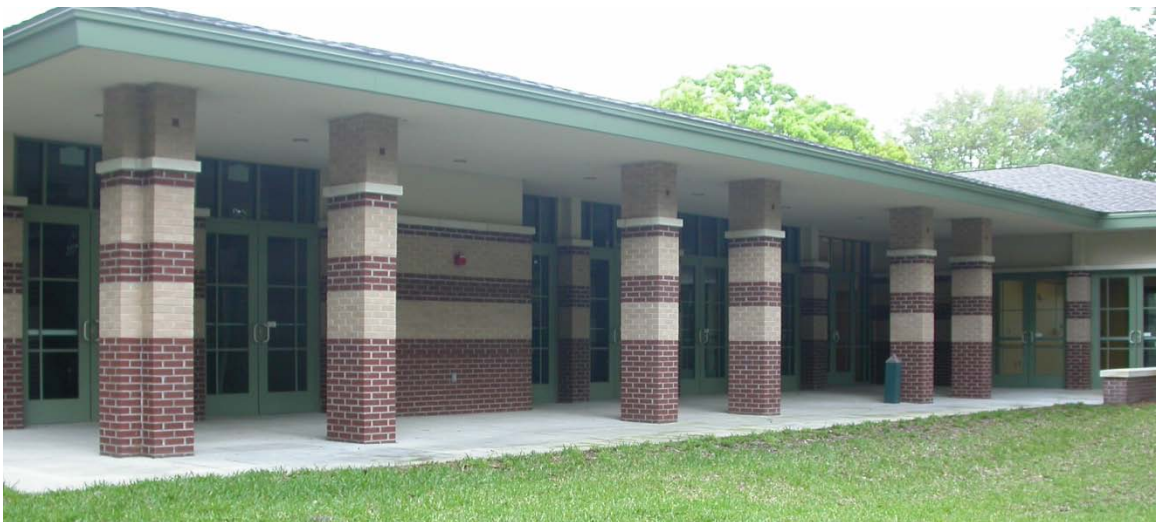
Covered patio outside multi-media room on north side