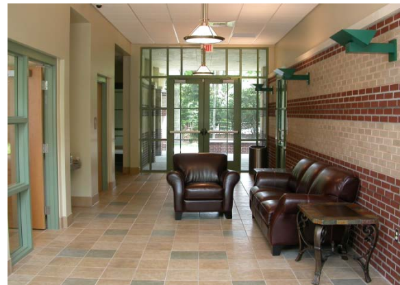
Entrance to lobby from tennis courts