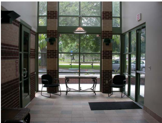
Entrance to lobby from McFarland Road