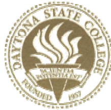
EXHIBIT B MANAGEMENT'S RESPONSE