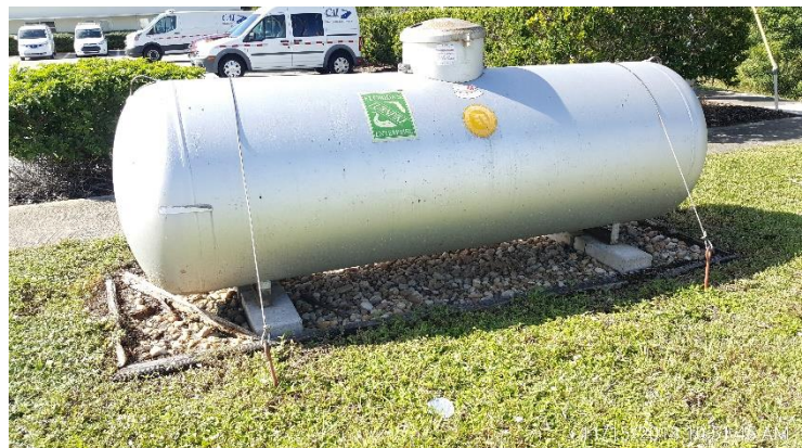
500 GAL. FUEL (LP) TANK