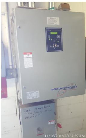
AUTOMATIC TRANSFER SWITCH (ATS)