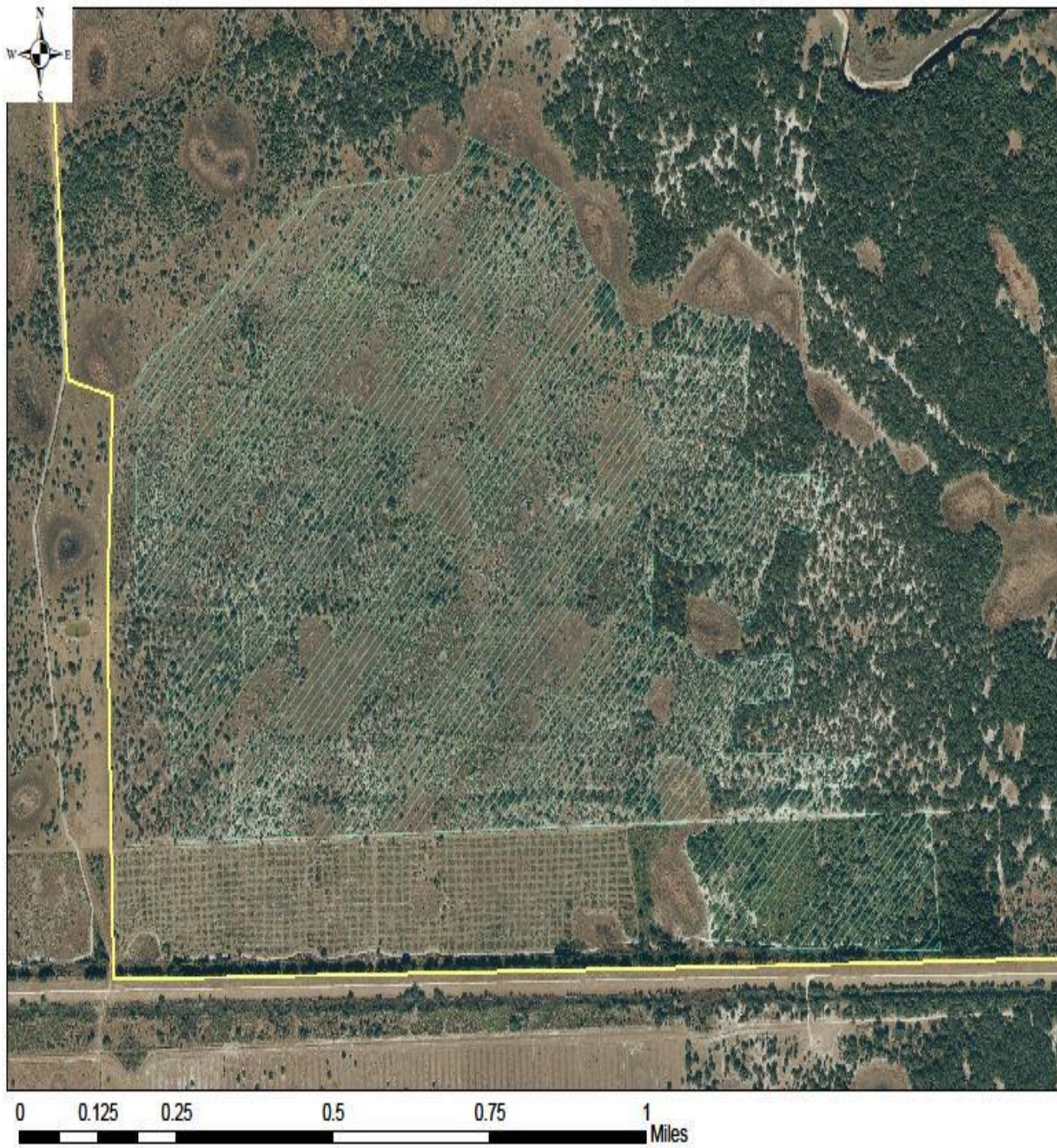
Figure 2. Project Area Map