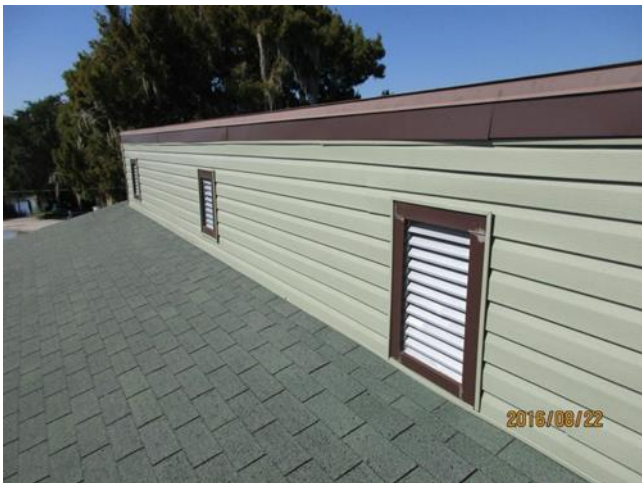
West Roof (higher) meets lower roof