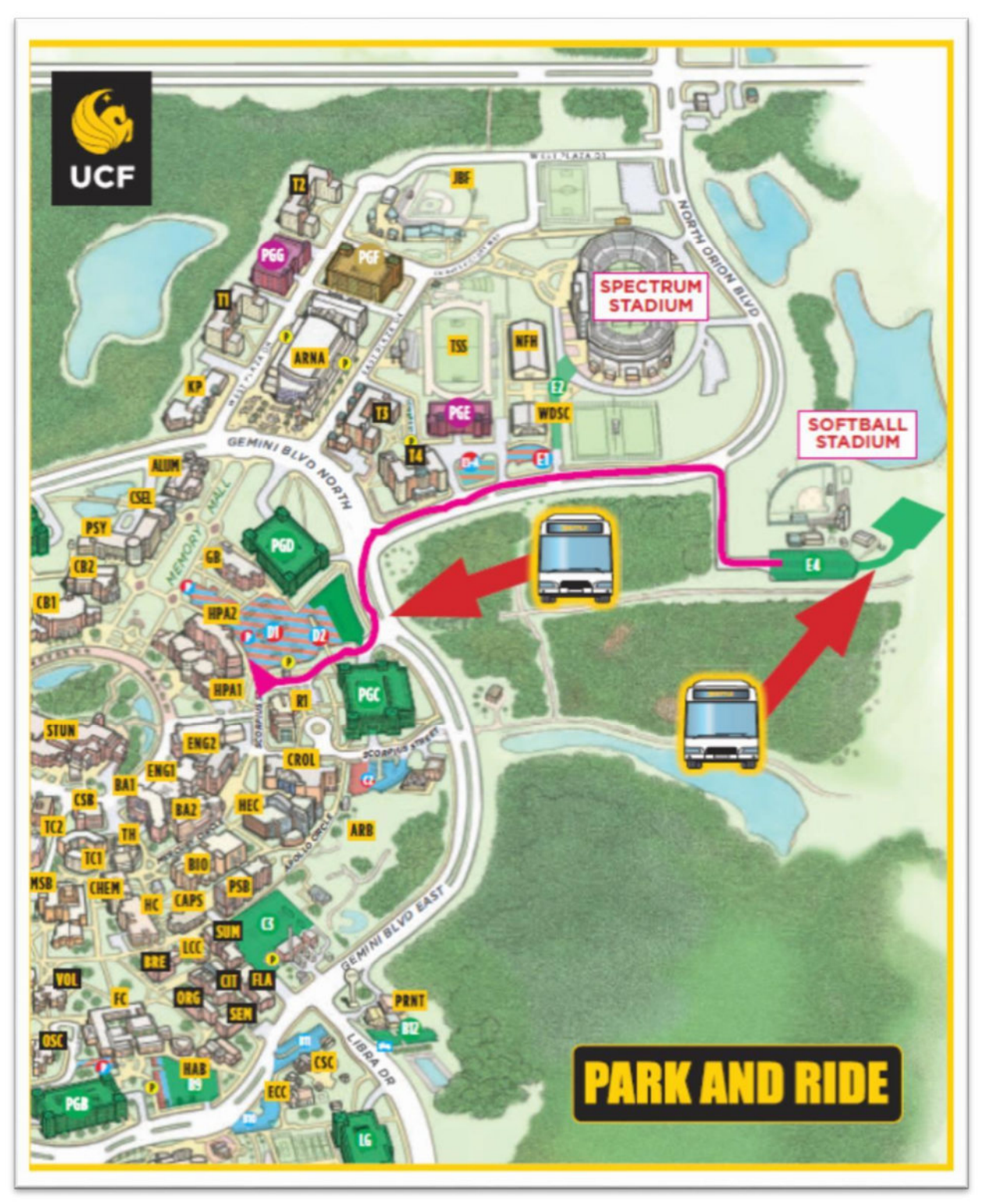
Figure 2: Park and Ride shuttle service between Lot E4 and the interior of campus.

f. Located within parking facilities around campus, UCF offers complimentary electric vehicle charging stations in five strategic locations: Parking Lot D1 (Memory Mall), Parking Lot B6 (Visitor Information Center), Parking Lot B1 (nearby Teaching Academy) Parking Garage A (first level, near elevators), and Parking Garage D (top level). Vehicles parked in electric vehicle charging