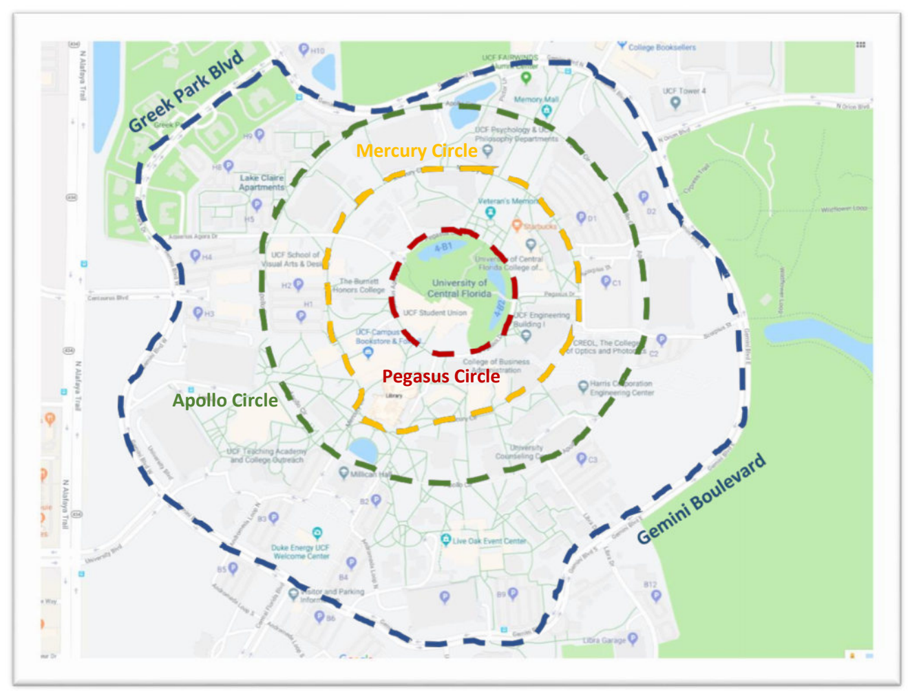
Figure 1: University of Central Florida main campus design consisting of four concentric circles: Gemini Boulevard, Apollo Circle, Mercury Circle, and Pegasus Circle.