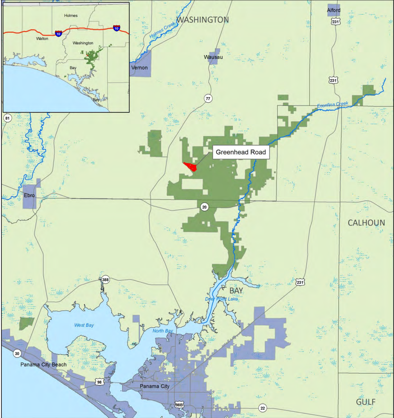
General Location Map 2017 Greenhead Road Sand Pine Timber Sale Econfina Creek WMA Washington County, Florida 340 Acres