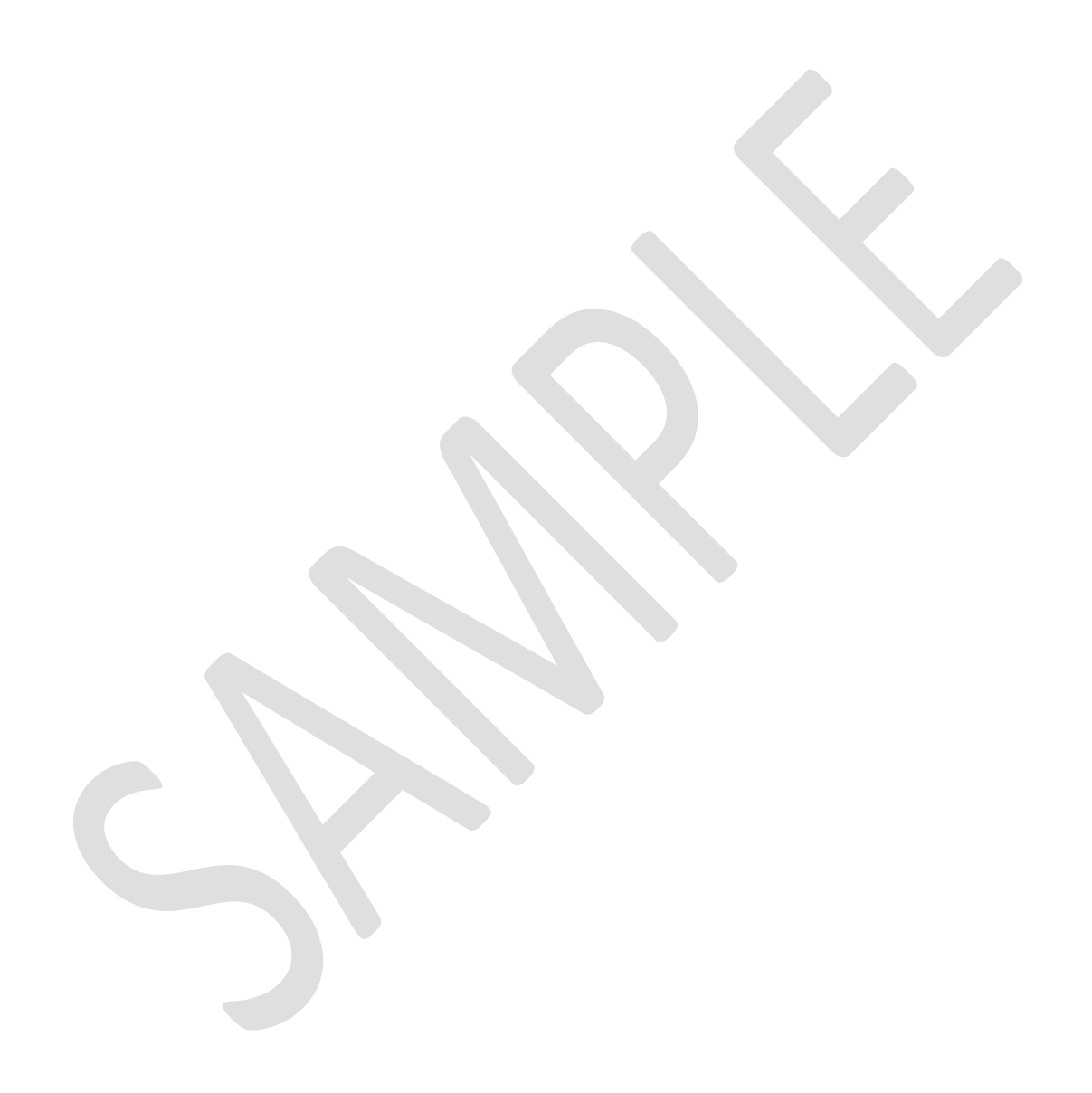
EXHIBIT 18 SAMPLE