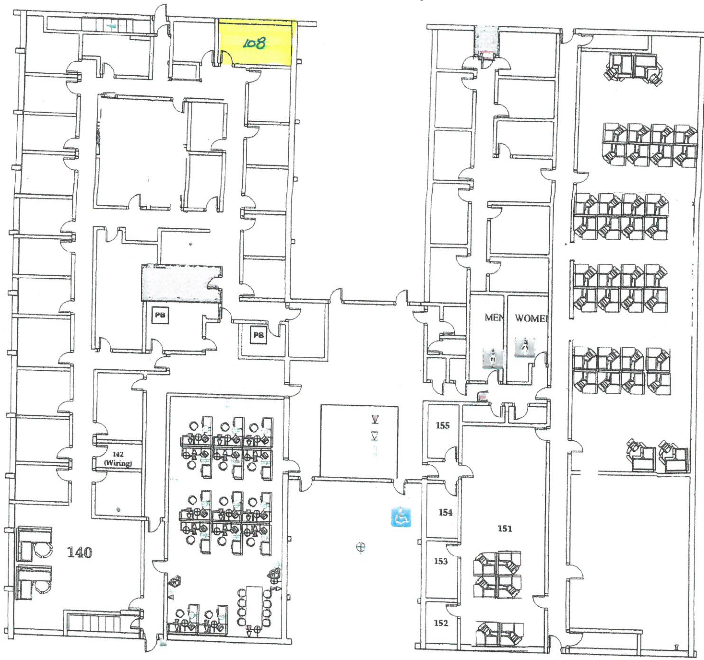
EXHIBIT 3 PHASE III