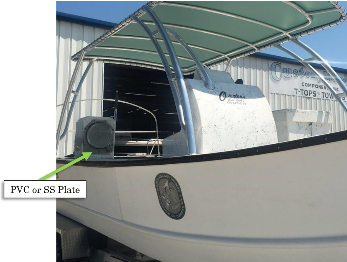
Figure 5. Example of Hauler mount, T top size and hull protection

* orientation will be different for the stone crab boat because the stone crab boat requires the tilt table (see figure #5)